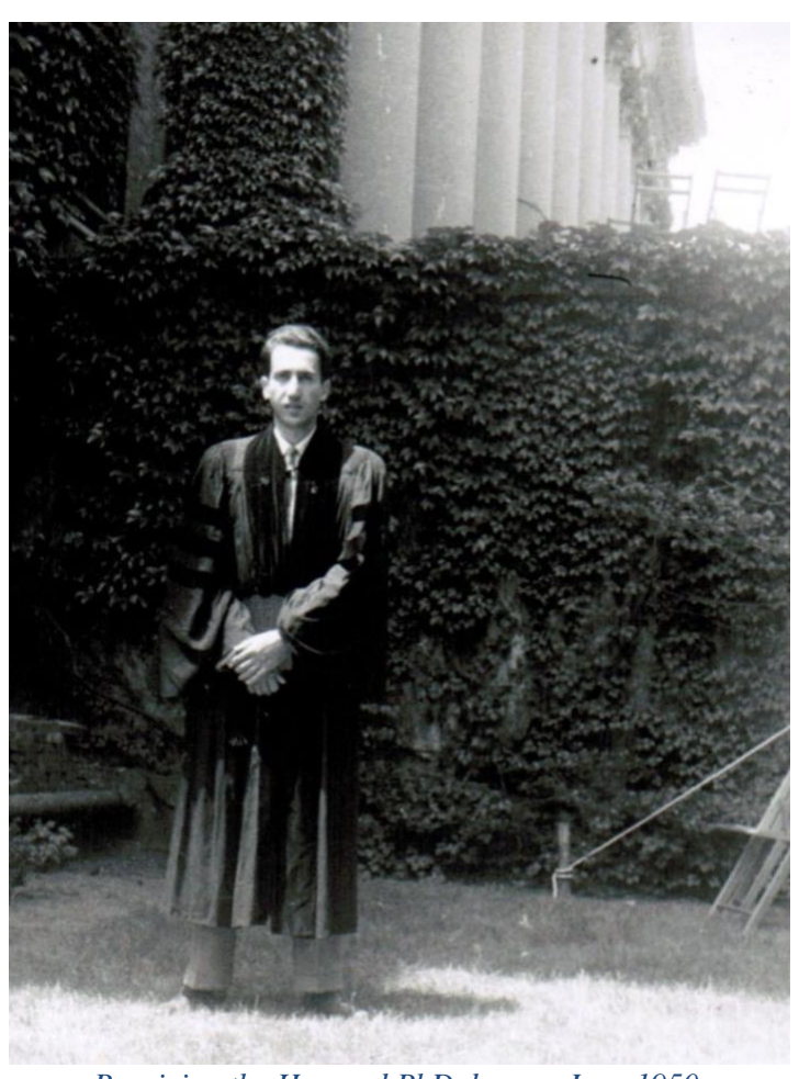
Receiving the Harvard PhD degree, June 1950.