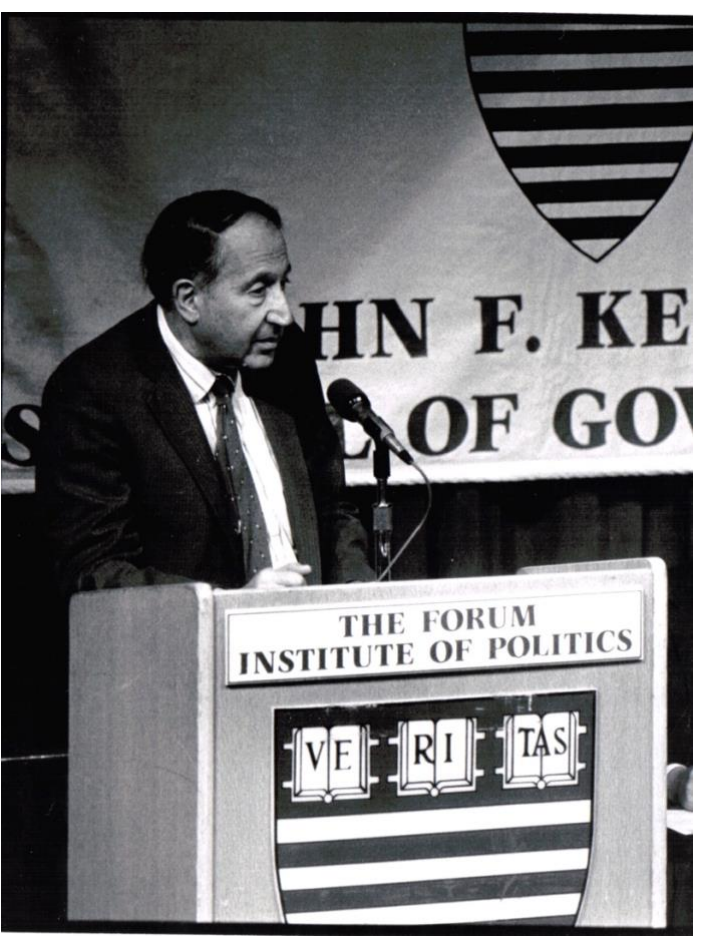
Speaking at the Kennedy School, February 1991.