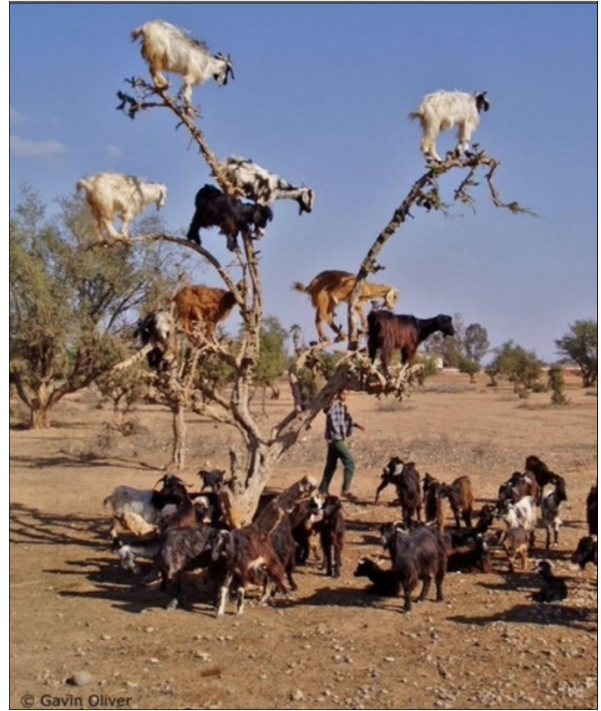
The Islamic ban on consuming pork opened wooded areas to sheep and goats and indirectly brought about a catastrophic deforestation evident in the Mediterranean districts of Islamic countries.

Beyond these somewhat random influences, Islamicate practices have done much to obstruct Muslims from modernizing . They affected three types of relationships: personal ones, intra-Muslim, and those with non-Muslims.