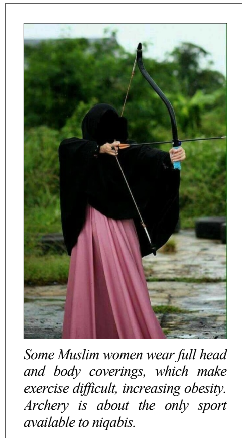
Some Muslim women wear full head and body coverings, which make exercise difficult, increasing obesity. Archery is about the only sport available to niqabis.

Polygyny is Islamic but its implications are Islamicate. Wives who worry that their husbands will marry another woman suffer from permanent anxiety; conversely, husbands enjoy immense leverage in the marriage. Polygyny also leads to what is termed excess men , males who remain unmarried due to females engaged in polygamous marriages. (Female infanticide then further distorts the gender balance, whether by crudely killing off newborns in olden times or by ultrasound tests and abortion today.) The presence of excess men leads to heightened criminality and violence