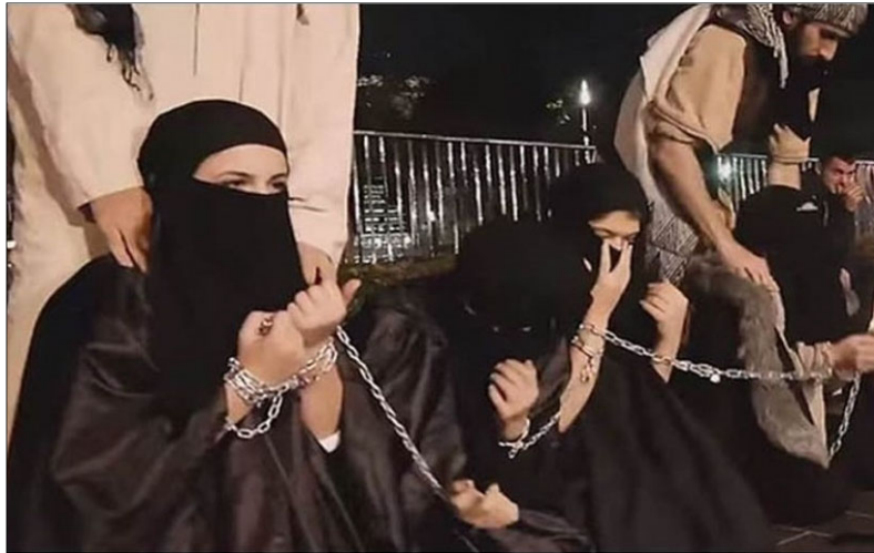
Forms of slavery exist in eight Muslim-majority countries. ISIS revived slavery, capturing Yazidi women and girls as sex slaves.

beheading; Islamic tradition records Muhammad as having decapitated seven hundred Jewish men of the Banu Qurayza tribe, thereby establishing the precedent and model for future Muslims . This Islamicate custom has the dual goals of striking fear and gaining political advantage. Major states, including those of the Almoravids, Ottomans, and Saudis followed suit, using this form of punishment against non-Muslims and Muslims alike. In recent times, most notoriously, the Islamic State in Iraq and Syria (ISIS) revived this practice.