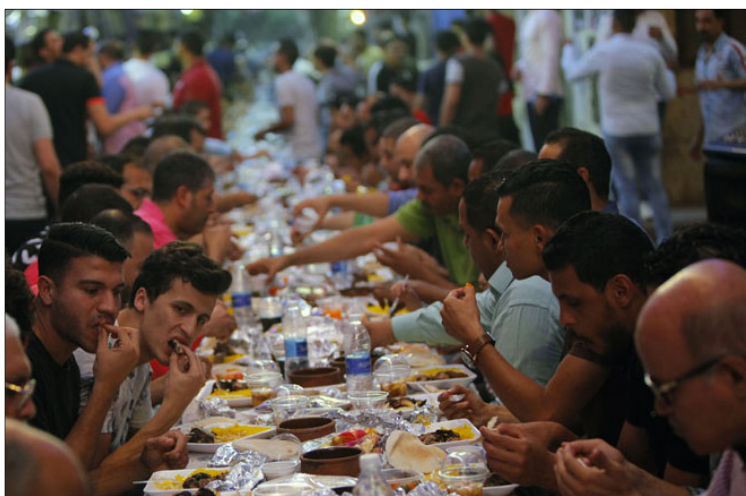
Ramadan is, ironically, a month of both fasting and overeating. Sugar is an important part of the nightly meals. In Turkey, the feast to end Ramadan is known as "the feast of sweets."

None of these modern customs is a religious obligation, but all follow logically from Islam's rules. Together, they constitute the lived experience of Ramadan. As this example suggests, while Islam tends to be seen in terms of its texts and precepts, it is also something much larger, a mix of traditions and innovations. In the aggregate, they form the civilization of Islam.