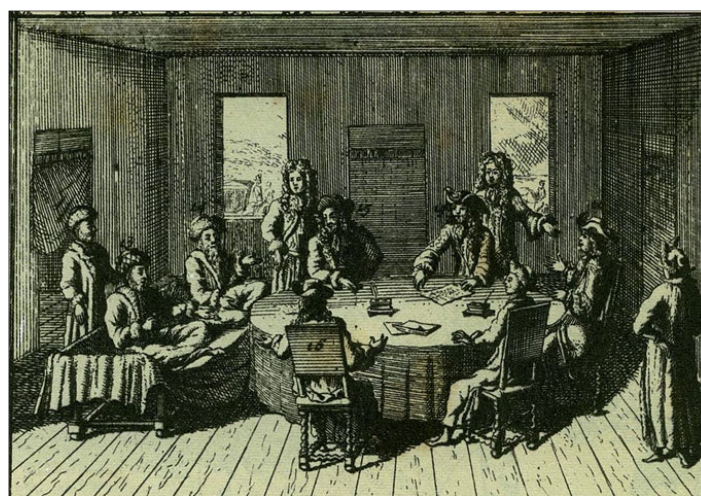
In the year 1699, the Ottoman Empire signed the highly disadvantageous Treaty of Carlowitz with the Holy League. After more than a millennium of threatening Europe, Muslims now had to defend themselves from the military superiority of Europe.

The following account looks first at several kinds of changes and then at several kinds of continuities. The main changes are three-fold: European strength of arms, lessened religious sentiments, and a Left seeking allies.