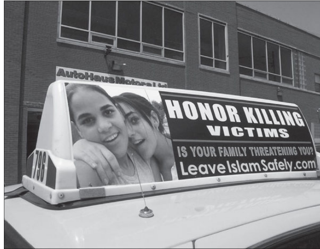
Sex remains a focus of criticism of Muslims, concerning such topics as female genital mutilation, child marriage, polyandry, and honor killing.

Thus, old prejudices remained intact. William Gladstone , a British prime minister, described Turks in his sensational 1876 tract, Bulgarian Horrors and the Question of the East , as “the one great anti-human specimen of humanity. Wherever they went, a broad line of blood marked the track behind them; and as far as their dominion reached, civilization disappeared from view.” 34 A future prime minister,