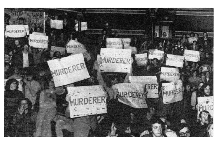
A Newsweek photograph showed some of the many 'MURDERER' signs at the counter teach-in.

In the end, the CRR found a mere nine students