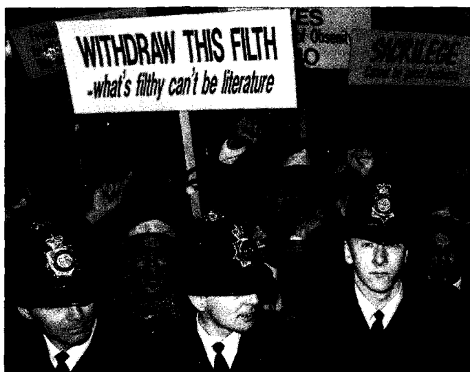
Muslims now number 1.5 million in Britain, and they turned out in force to protest Rushdie's novel.