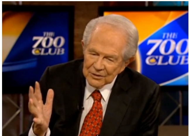
Pat Robertson, a Christian media mogul and one-time candidate for U.S. president, finds “tremendous fatalism in Islam ... You’ve got flies in your face; it’s the will of Allah. A child is hungry; it’s the will of Allah.”

dreams, they relapse into indolence and do not persevere in any attempt to bring their ideas into focus with reality. This tendency is exaggerated by the fatalism of their religion.” 26