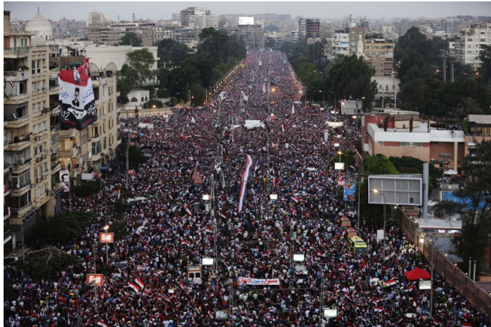
Rulers who expect Muslim political passivity may be in for a rude surprise: Muslim masses have often taken forceful action. The demonstration across Egypt against Mohamed Morsi in June 2013 was the largest, single political event in human history, involving millions of protestors.